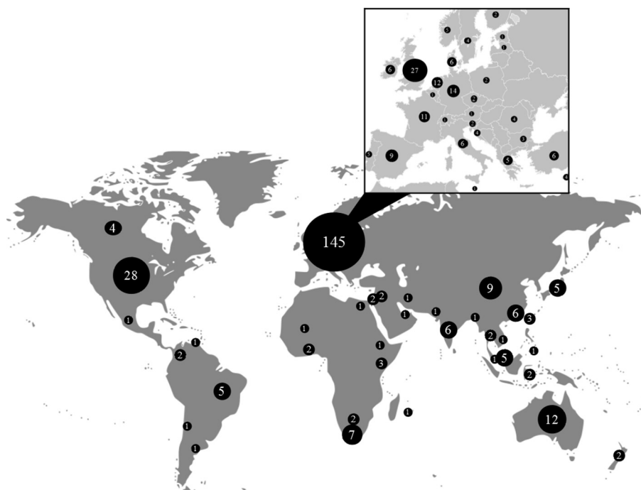
Fig. 1. Countries represented by reviewed studies. Numbers indicate amount of studies investigating a sample from a particular country (several countries per article possible; same original sample might be counted repeatedly when presented in different articles). One article (Clapp and Swanston, 2009) was excluded because no sample was investigated.

Although microplastic has become a hot topic in media and environmental science, social-scientific studies on the perception of microplastic and its risks are rare to date. By definition, such plastic particles are small and thus difficult to see and retrieve from the environment compared to macrodebris (cf., Barnett et al., 2016, for such an observation by Candian fishermen). Interviews with beauticians, students, and environmentalists show that only the latter were aware of microplastics in facial scrubs (Anderson et al., 2016). The majority of participants indicated awareness that these particles will go into the ocean after use. After participants of this UK study were made aware of these issues, they reported environmental concerns, especially risks for marine fauna. However, for them these environmental problems are not as pressing as others (Anderson et al., 2016). Overall, (macro- and micro-) plastic is generally seen as an environmental hazard, though to a varying degree.